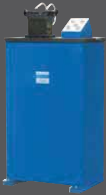
L71-UV Electrical Broaching Machine