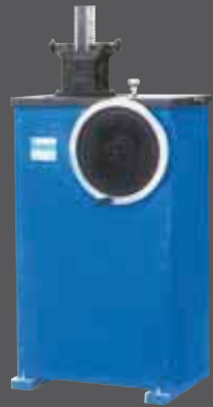
LS71-UV Manual Broaching Machine

This machine is mainly used to make U or V shape notches on impact test samples. The machine can cut this notch with only one stroke of the cutting knife. Easy and fast, be suitable for preparing the samples under continuously impact test in metal laboratory, inspection department and other facilities.